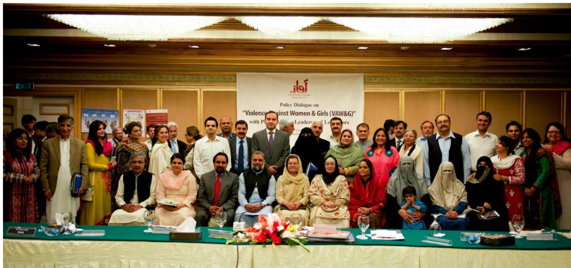
Figure 5: Group Photo, participants of policy dialogue with honorable chief guest Mr. Murtaza Javed Abbasi, Deputy Speaker National Assembly